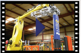
Vertical Roll Handling