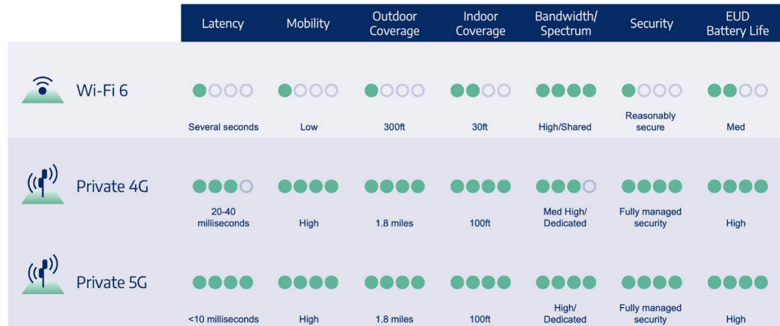
Figure 1: When to consider Private 4G/5G

Wi-Fi 6 provides high bandwidth for a limited number of devices, is cost effective, and is easy to access. However, Wi-Fi struggles when latency, mobility, coverage, and security are required (see Figure 1). For business-critical applications, Wi-Fi is not the best solution.