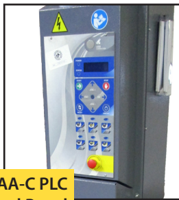
1100AA-C PLC Control Panel