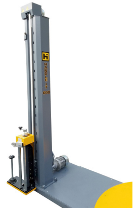
Powered carriage tower with photo eye