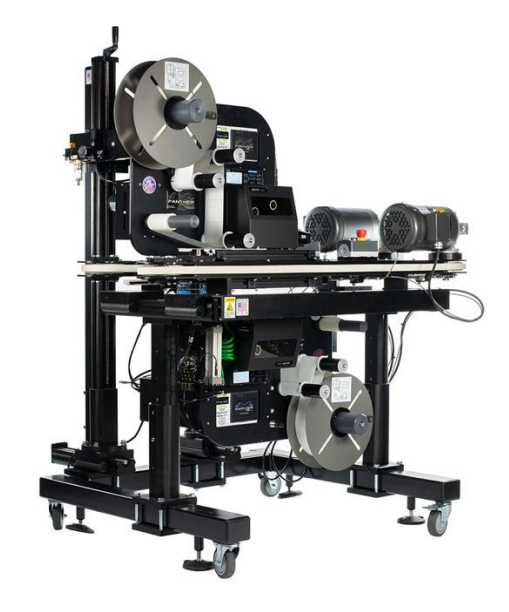
The final Panther Industries labeling automation solution for Mountain Man Nut & Fruit Co., incorporating two Panther P8 pneumatic label applicator systems integrated with a hugger belt and corresponding outriggers.

Panther's product line, along with Mountain Man's ability for material handling, ensured the partnership was the correct one.