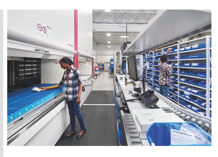
Fast and error-free access, and inventory is delivered to an ergonomically-correct height.

Industry Group: MHI AR/RS INDUSTRY GROUP