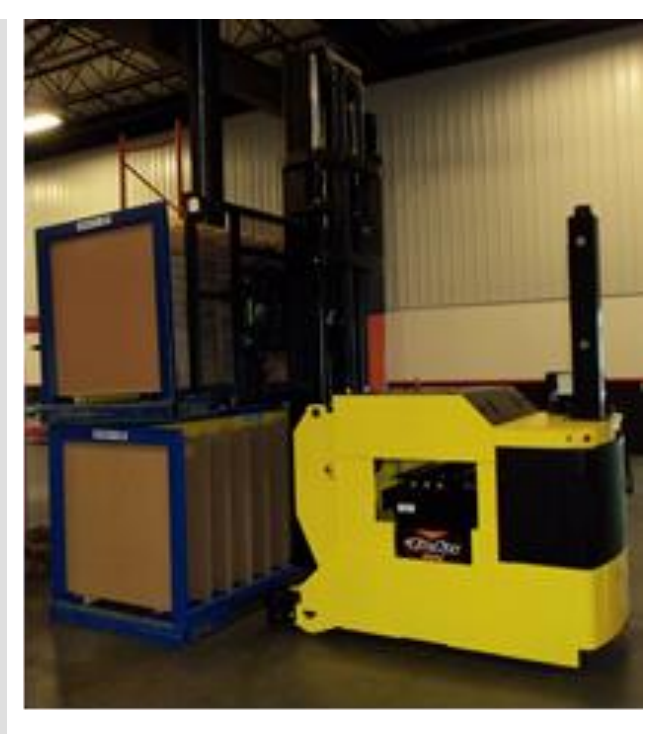
AGV transports Container and Underlayment Rolls on Pallets

The AGV System operates 24/7 and facilitates the movement of full and empty containers of product as well as underlayment rolls on pallets between block stack storage lanes in WIP container storage areas and various conveyor interface points throughout the facility's production areas. The vehicle control software communicates with the host computer.