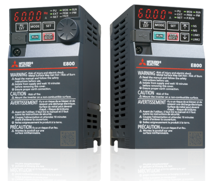
The FR-E800 from Mitsubishi Electric gives the operator more control over speed.